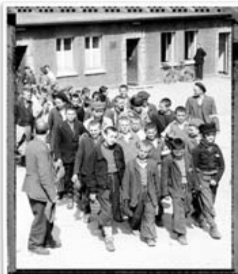
Prisoners at Buchenwald camp march to get medical treatment from U.S. soldiers after the camp was liberated in April 1945.

⚡ Hanover-Ahlem labor camp: This was the last stop for thousands of prisoners transported through the camp system. Most arrived from Auschwitz to work under grueling circumstances. It was liberated on April 10, 1945, by American soldiers.