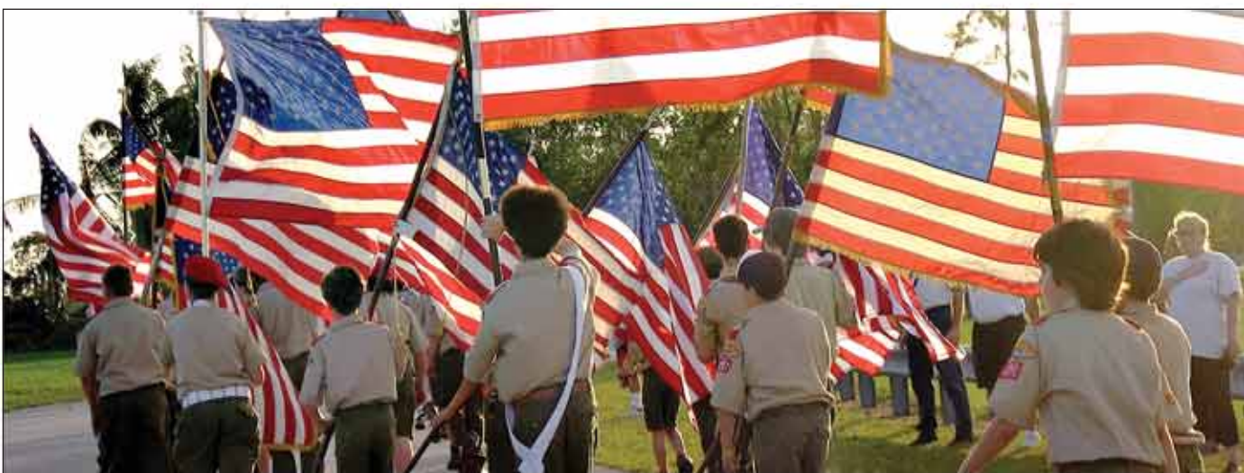
Scouts parade at 2005 Scoutmasters Camporee held at Markham Park in Broward County.